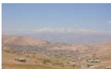
Overview of the village of Aarsal

The first site, Aarsal , is located in the northeastern area of the Bekaa, 180 Km from Beirut, with an altitude ranging from 1,400m to 2,600m. It is among the most arid areas in Lebanon. Its estimated area is 360 Km 2 ; i.e. about 5% of Lebanon's overall area. Aarsal owns the largest herd of cattle (goat & sheep) in Lebanon. In addition, Aarsal has a wide variety of plants such as fruit