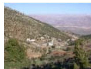
Overview of the village of Nabha

villages, Al-Harfoush, Kalila, and Al-Kouddam, are considered geographically, environmentally, socially, and economically part of Nabha. The region of Nabha is known for its richness in edible and medicinal wild plants such as wild mint, wild rhubarb, and barberry, as well as wild fruit trees, such as almonds, plums, pistachio, pears, etc.