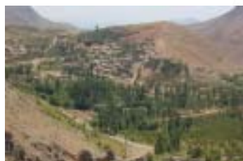
Overview of the village of Ham

The third site is the village of Nabha located at the foot of the Lebanese Western mountain chain, connecting with the Bekaa valley west of Baalbeck, at an altitude ranging between 950m and 1,900m above sea level. Three surrounding