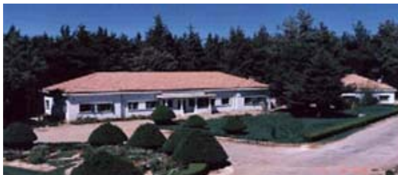
The Lebanese Agricultural Research Institute, Tel Amara Station Bekaa, Lebanon