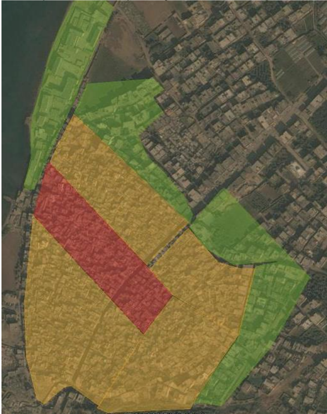
Map 1: Contamination Map following Risk Assessment 11-12 April 2008

The risk assessment identified the following 3 groups of risk to the survey.