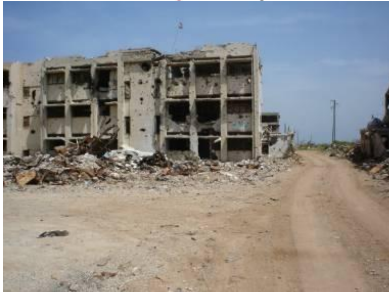
Figure 2: View of UNWRA Building