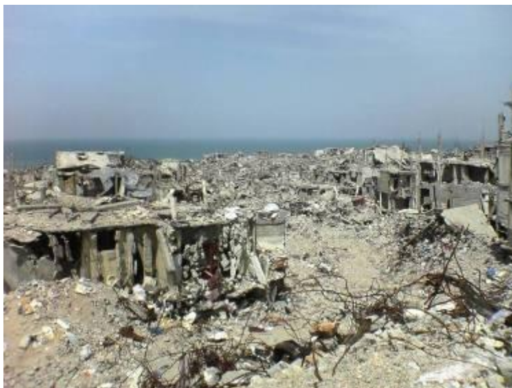
Figure 1: View from East to West showing centre of the camp